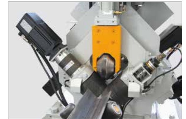
Angle infeed system with roller