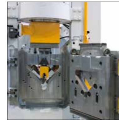
Quick-change blade holder

The Ficep CNC "A" Series angle lines are also available with a double cut shear to reduce the initial investment without sacrificing the cut quality.