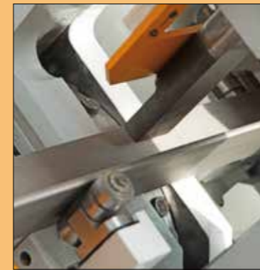
38-character rotary marking unit

Pegaso is the new generation CNC for Ficep machines. PC, CNC and PLC are all integrated on a single board to have the maximum reliability and simplicity. Pegaso is based on field bus technology: Can Bus and Ether CAT, with up to 32 axes controlled.